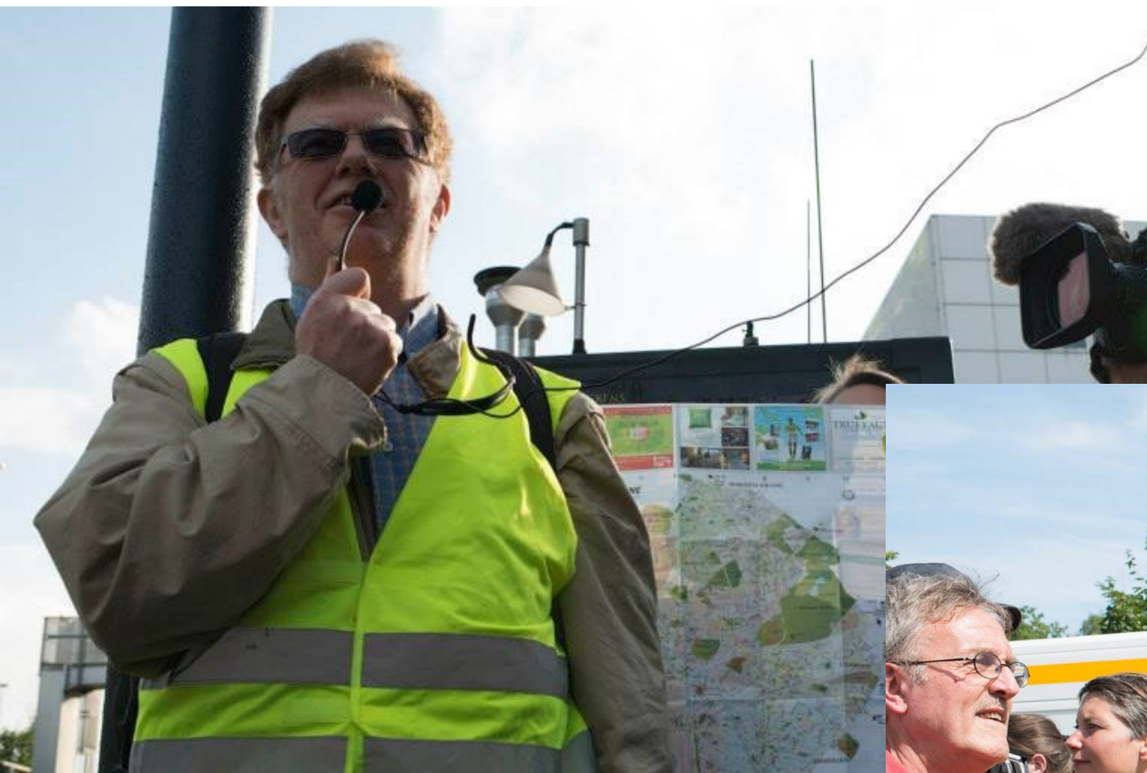
Toxic Tour Detox 93, walk around the highway which crosses Saint-Denis city, June 2015.