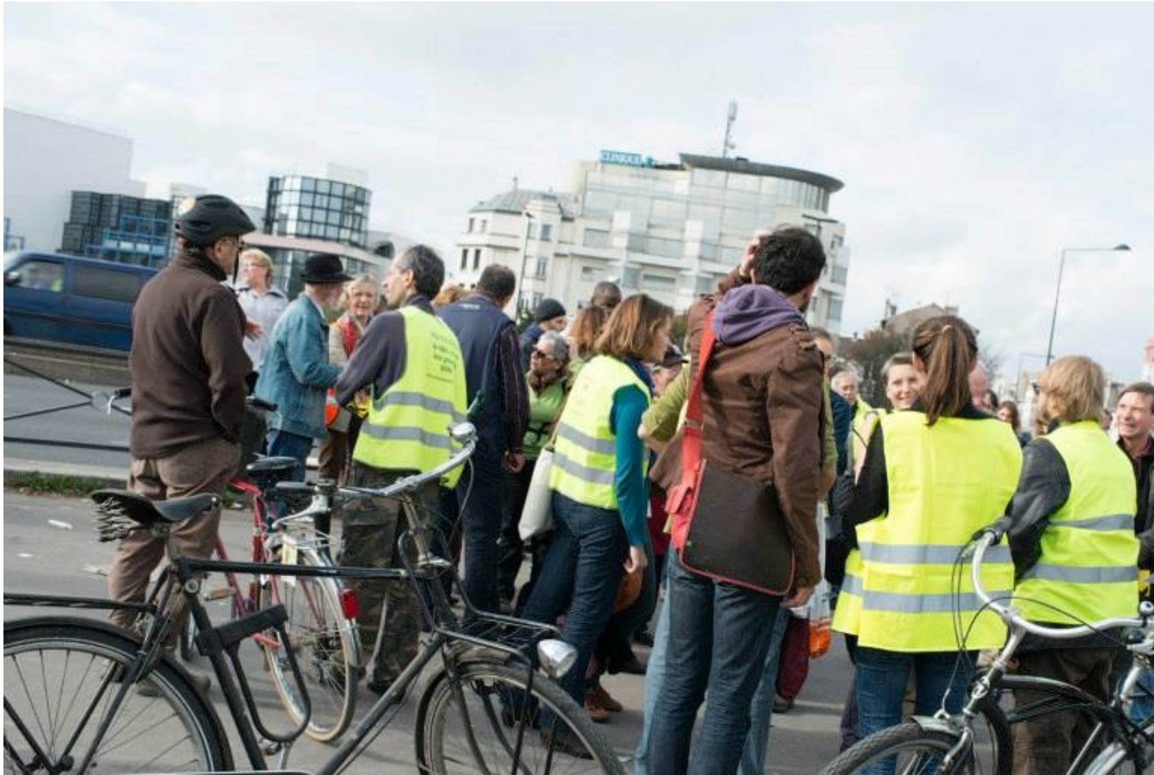
Toxic Tour Detox 93, walk around the highway which crosses Saint-Denis city, Septembre 2014.