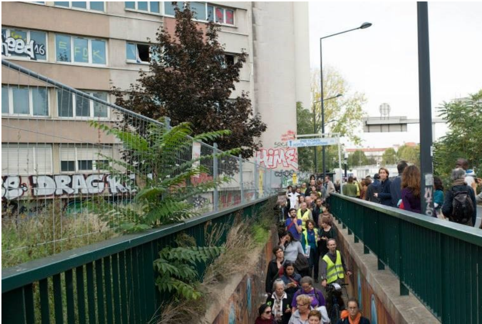
Toxic Tour Detox 93, walk around the highway which crosses Saint-Denis city, Septembre 2014.